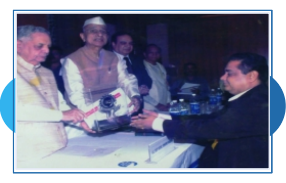
CMD, Receiving the prestigious "UDYOG RATTAN AWARD" by The Governor of Gujarat.